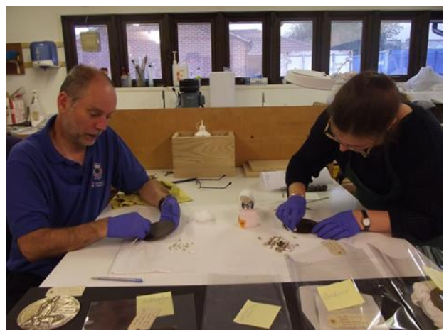
'Death pennies' undergoing conservation