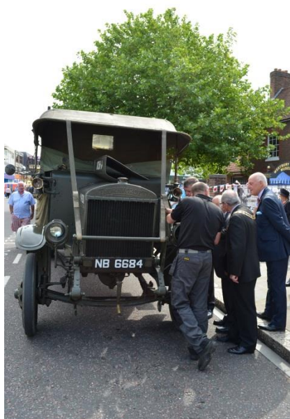
The Mayor prepares to board outside museum

The County Council's First World War Thornycroft lorry built in Basingstoke in 1916, which was returned to full working order by staff and volunteers based at Chilcomb House last winter, was transported to Fareham on 4 August to take part in the commemorations to mark the outbreak of war. The Mayor of Fareham rode from the museum to the memorial service in Trinity Church in the cab of the 'J-Type' lorry before it departed for Winchester to perform a similar function for Hampshire County Council at the Great Hall on this significant date.