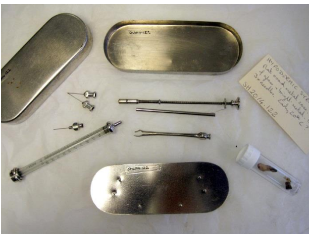
Syringe after conservation

A great number of objects were conserved in the conservation labs at Chilcomb House in preparation for the '1914' Hampshire Big Theme programme exhibition, 'Soldiers' Journey', during this period. The exhibition being prepared for Westbury takes hospitals, medical treatment and knitting as themes so the objects receiving attention included a First World War syringe, stethoscope, bandages, a knitting machine, knitting patterns and woollen garments, as well as 'Princess Mary tins, medals and 'Death Pennies' that will be included in most of the 'Soldiers' Journey' exhibitions being launched simultaneously in the nine other county venues in October.