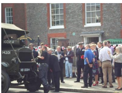
100 Years Ago event 4 August

The biggest event at the museum this summer was the 100 Years Ago Today event on 4 August. The CELO provided a wealth of activities in the recreated recruitment office – flag and bunting making, mock-ups of attestation and medical forms, info to read, costumes to try on. She also produced the Fareham Poppy Trail Quiz which started at the museum and took participants up and down West Street to discover what the area was like in 1914 and find fascinating facts about the town’s War Memorial, church and WW1 history. Many of the activities stayed on as self-led activities for families for the rest of the holiday.