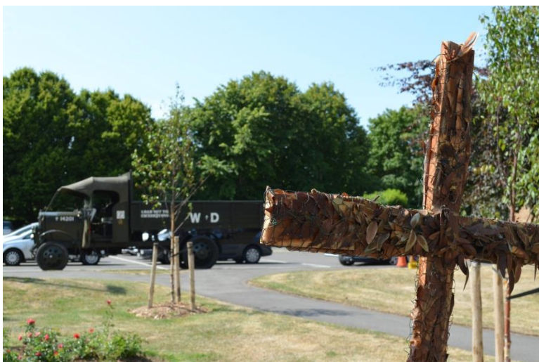
The Thornycroft lorry arrives at Trinity Church for the memorial service