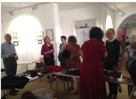
Great Night Out at Westbury Manor

The afternoon talk on the strawberry heritage was very well received and we plan to offer more ‘tea and talk’ afternoons on week days in term time, especially for older adults. Another new venture was the Great Night Out which linked to the town centre Vintage Fair the following day. With staff in vintage costume, displays of vintage era museum collections, food and wine, it was a booked and ticketed event for adults which proved popular with local ladies. The handling collection of clothing and accessories put together by the CELO also attracted nearly 60 people in from the Vintage Fair on the Saturday.